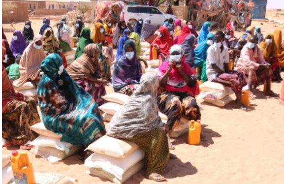
Provision of food distribution items to the drought affected community and IDPs in Budunbuto village and surrounded rural areas in order to save their lives.

Somalia is experiencing its third consecutive below-average rainfall season since late 2020, which is worsening the current drought. Most of Nugal region have received little to no rainfall since June, as the October to December 2021 deyr rains are delayed. Somalia has been facing a series of life-threatening droughts for the past few years. Due to the ever-rising global warming and drastic climate changes, it doesn't rain as usual. As a result, livestock and crop production on which the majority of the Somali society depends have been endangered. Many nomadic pastoralists who have lived in rural areas, moving from place to another in pursuit of water and pasture are now living in refugee camps because their livestock is no more.