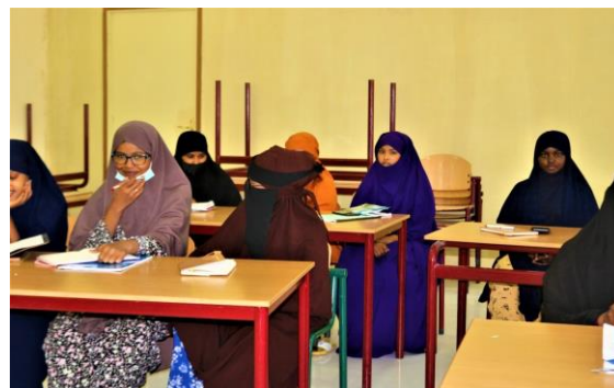
Image 2: Students taking an accounting class

unemployed girls with no skills to provide for themselves to be financially self-dependent. The girls are selected in a fair process of examination and family background check.