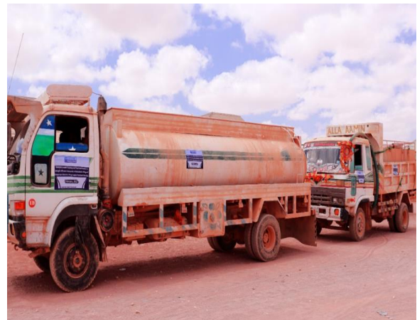
Emergency water tanks to provide drought affected households in Budunbuto village.

A large number of animals and even people have died of starvation and lack of water. In Nugaal region of Puntland State of Somalia and most of the other regions in the country, it has not rained for more than ten months. The last time it rained was in May 2021 and the rain kept off ever since. There is no pasture for the livestock to graze, wells, boreholes and ponds dried up and consequently, nomadic communities as well as their livestock are facing shortage of food and water.