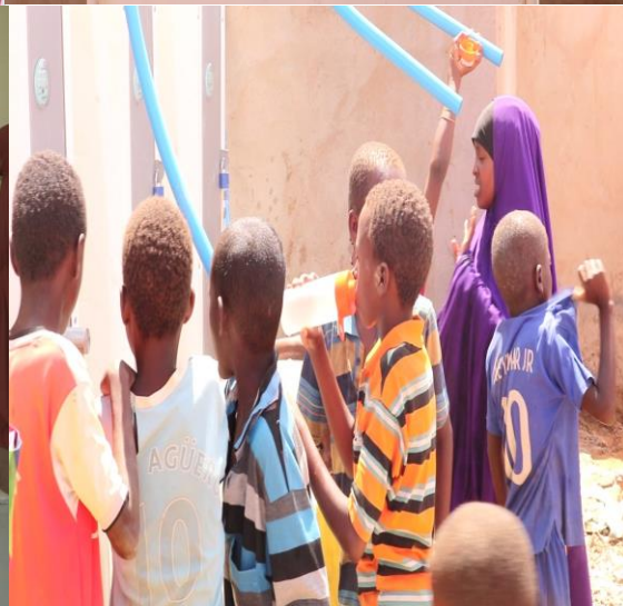
Drink clean water Project photos and IDPs' women and children trucking and jostling to fill their jerricans at the village pump of water filters implemented in Budunbuto and Camp Shabeelle in Garowe implemented by Kaalo Nederland Garow.