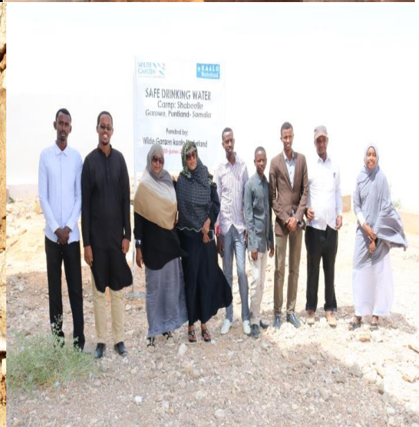
Implementation building Projects Photos of Shelters, Schools, Berkeds in Budunbuto, Caana Yaskax, Birta dheer Villages ,and Construction of Youth, city center Library in Garowe, Puntland-Somalia